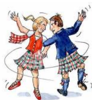
Scottish dress is optional

Come and join in the fun at a Burns Night on Saturday 25 th January, the Bar open from 6pm, with Haggis Neets & Tatties, followed by DJ and disco from 7.30pm.